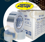
AB TAPE ALUMINIUM TAPE