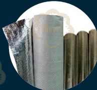
WOVEN METALIZING FOIL SINGLE & DOUBLE SIDE