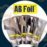
AB ALUMINIUM FOIL SINGLE/DOUBLE DS/FR (Ready another type)