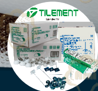
TILEMENT SPINDLE PIN, WASHER, & ADHESIVE GLUE